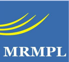
Multireach Media Private Limited